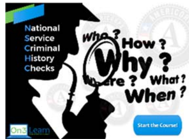
Ability to Implement Course Related Tasks